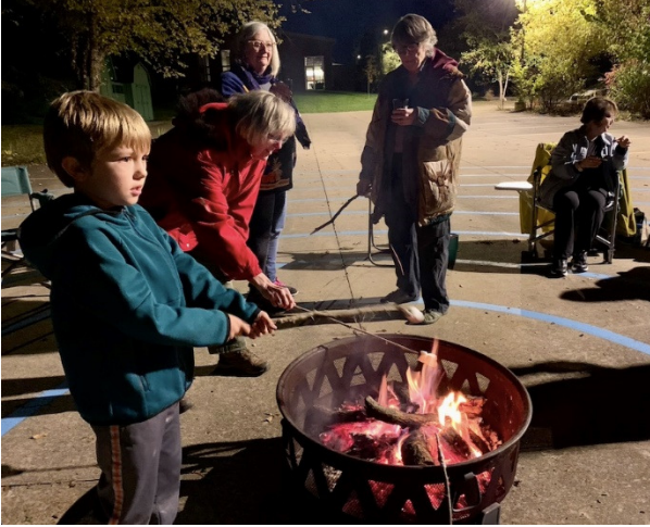
Pumpkin Decorating and Campfire Fun!