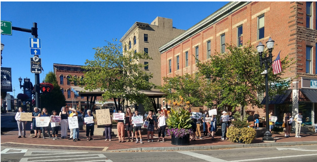
Rally for Peace – Stop the War on Gaza

Our next meeting will be 7 PM October 17th (3rd Thursday) at the Fellowship. We try hard to limit our meetings to \leq 1 h 15 min I'll send a reminder in October via googlegroups.